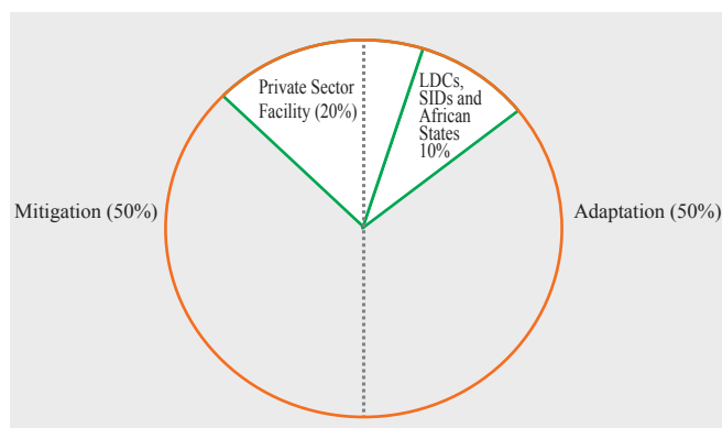
Figure 1 : Illustration of First tier allocation

「The Board decided to allocate 20% of GCF’s total cumulative commitments through the Private Sector Facility (PSF) for both mitigation and adaptation」