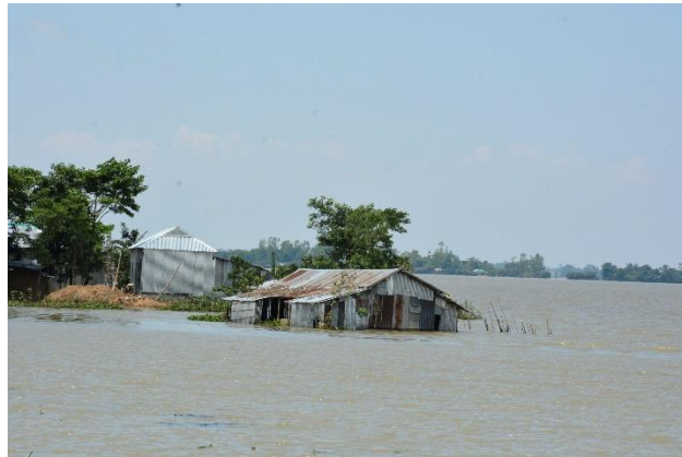
Figure 2 Flood Damages thousands of Houses in Derai