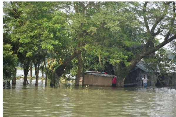
Figure 1 Figure 1 People are in huge sufferings due onset flash flood: Photo © A Rahman