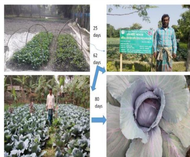
Figure-1: Life cycle of the red cabbage in farmer field

In the Fiscal year 2020-21 NGF provide Rubi king variety seed and Equipment among 4 farmers. Farmers get High price because the attractive color and taste. The price was comparatively more than green cabbage. In the December month Green cabbage was 08-12 taka per kg but Red cabbage was 15-18 taka per kg and consumer demanded. In the 2021-22 Fiscal Year 28 Farmer in 5 acre and 2022-23 Fiscal Year 49 in 20 acre area cultivating red cabbage in their own effort. So the crop is adopted by farmer for the NGF initiative. Comparative study has shown